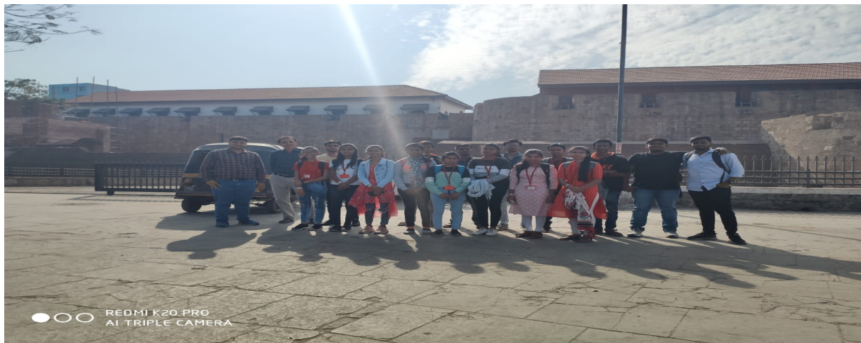
Fort- Architectural Monument, Surat (15 Feb, 2020)